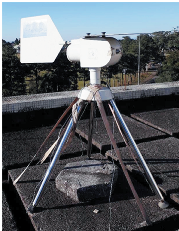
Figure 1 Hirst-type, SporeWatch Sampler

Morphologically similar grass pollens and pollens from other plants were identified and counted in number of grains/m 3 of air. The intensity of pollen dispersal followed the classification of the National Allergy Bureau (NAB), which is part of the American Academy of Allergy Asthma & Immunology. 22